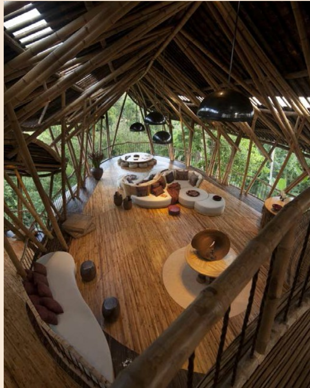
GREEN VILLAGE BALI & BAMBOO VILLA