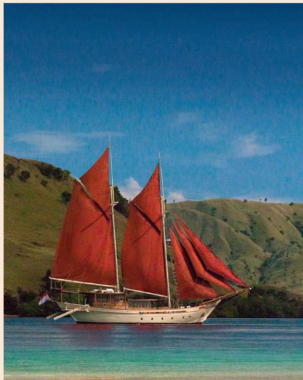
SI DATU BUA