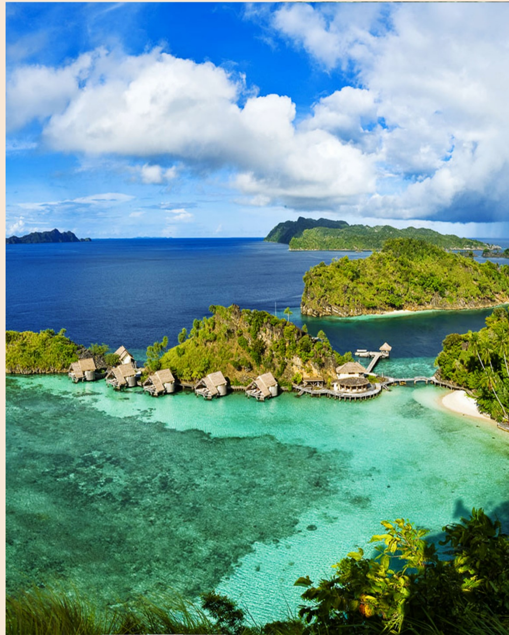
MISOOL ECO RESORT